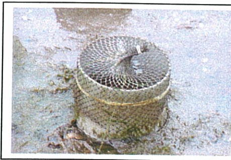
Above: PVC pipe planted with geoduck. Right: PVC pipes covered with a single, large net.

Because of the low tidal elevations that geoducks are planted, visibility of the PVC pipes will only occur approximately 5% of the daylight hours over a 6-year crop cycle.