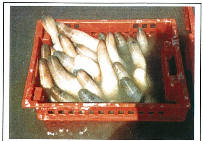
Top left: Harvesting geoduck. Top right: Geoducks harvested and ready for market.