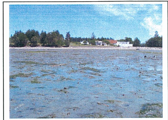
Above and left: Planted geoduck beaches after PVC pipes are removed.